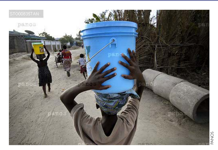
To keep a clean environment for PLWHA, households may require as much as 20 to 80 additional liters of water a day.

well as information on what to clean and how. Care and support guidelines should provide specifications for water collection technologies.